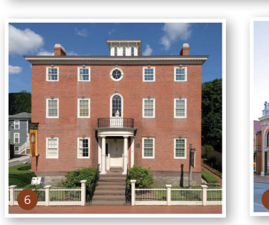
Whitehorne House Museum