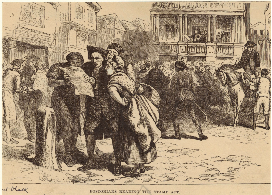
Bostonians Reading the Stamp Act, New York Public Library.

How did the people of Boston react to the news based on this drawing? How can you tell?