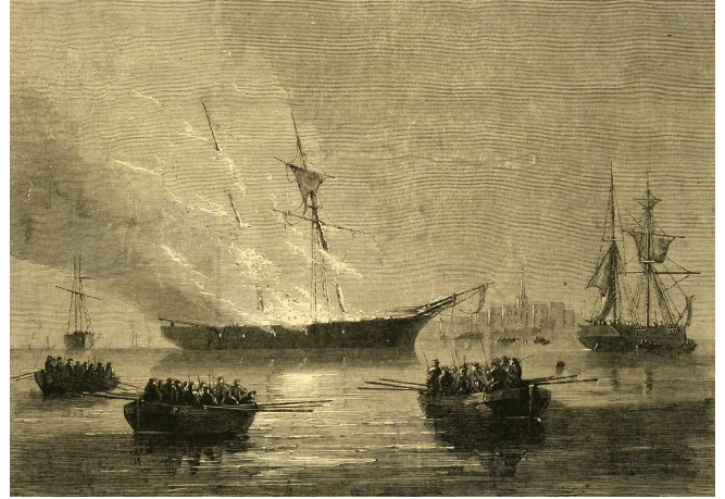
Burning of the Gaspee, New York Public Library.

Although Great Britain demanded an investigation into the incident to arrest the guilty parties, no one was ever legally identified or punished.